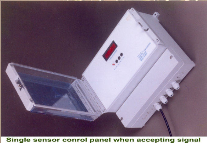
Single sensor control panel when accepting signal